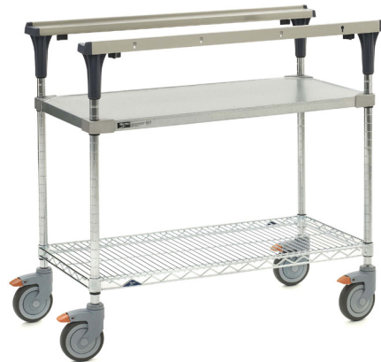
MS1836-FGBR: Solid Galvanized and Brite Wire Shelves

All Metro Catalog Sheets are available on our website: www.metro.com